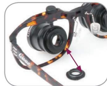
Interchangeable diopter lens